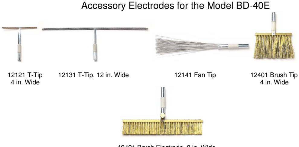
12421 Brush Electrode, 8 in. Wide

INSTALLATION. A standard tip electrode, Part No, 12201, illustrated above, but not below is included with each model. To install it, press it into the tip of the generator handle. To remove, grasp its base firmly, and with a gentle twisting motion, pull out from the generator tip. Never insert or remove the electrode while power is on.